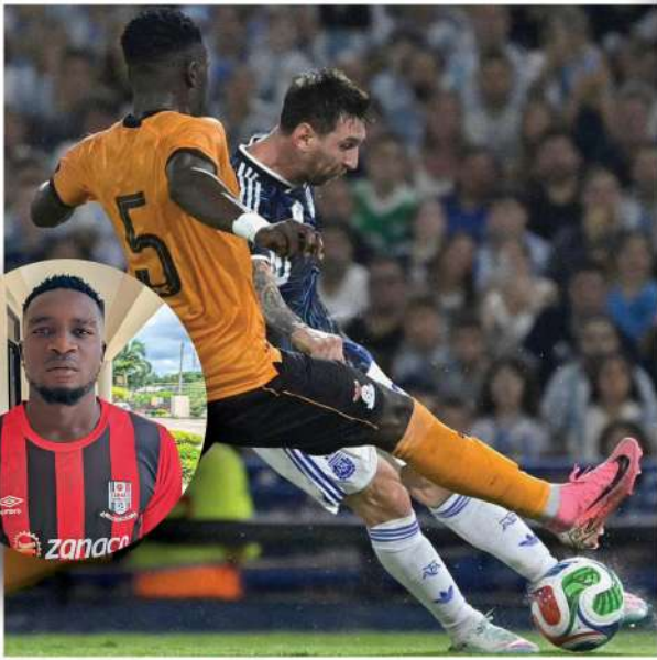
Zanaco FC defender, Tinkler Sinkala fights for the with Lionel Messi of Argentina last march