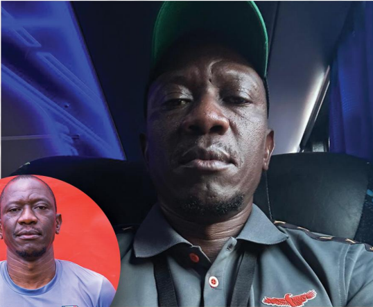
Zanaco FC assistant coach in Argentina with the National team for a friendly match